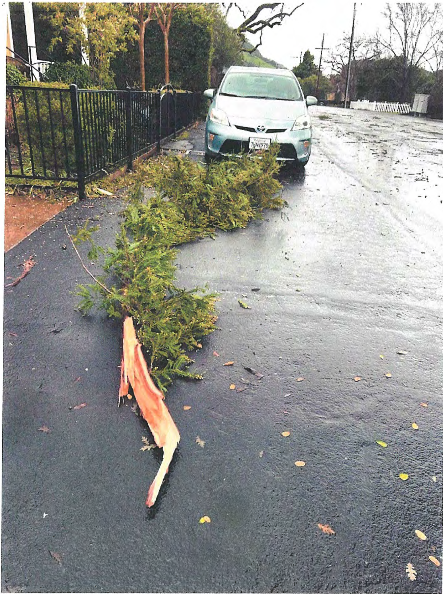
Area 1 photos