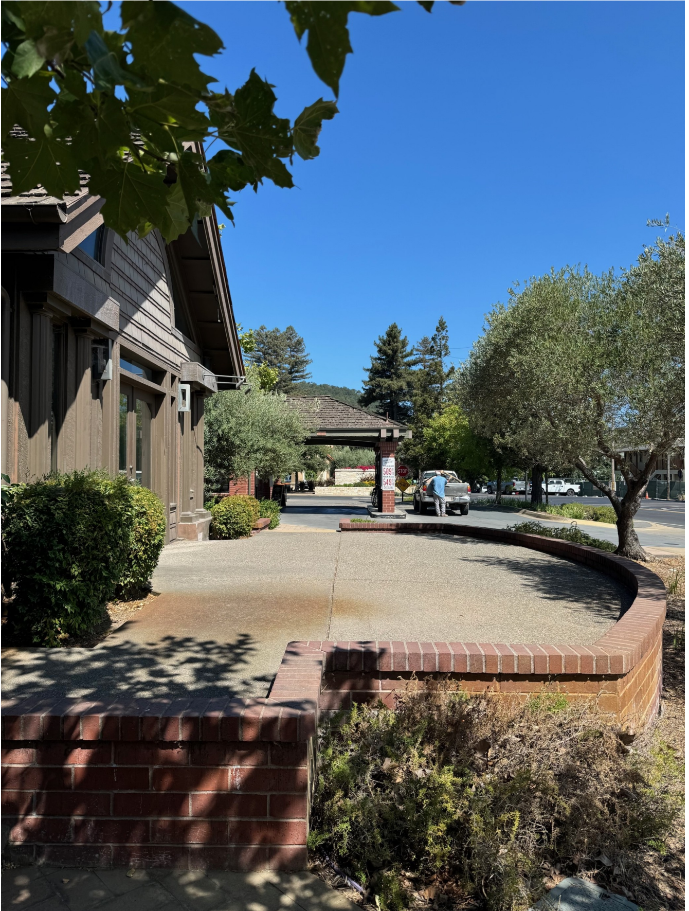
North view of Building and Patio