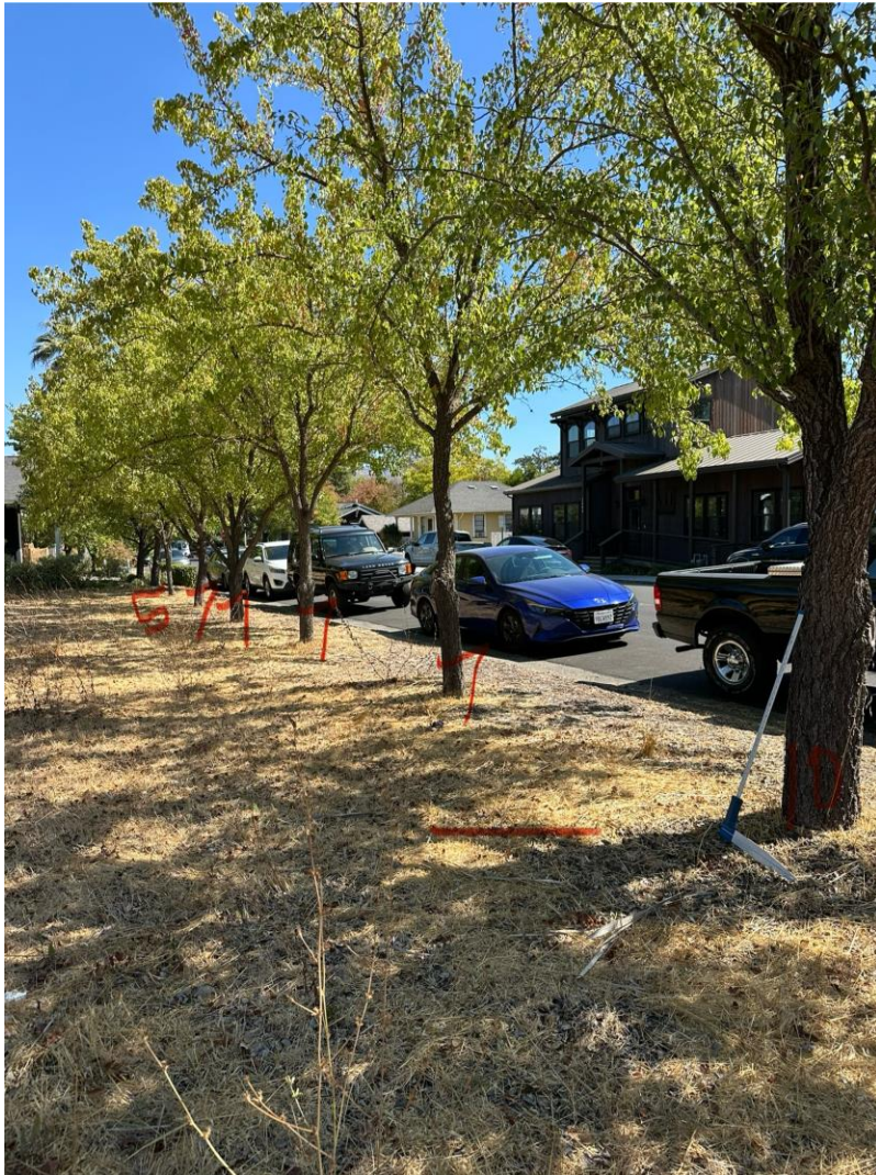
Photo #1. Trees along Humboldt Street. Opacity appears better in the photo than it actually is.