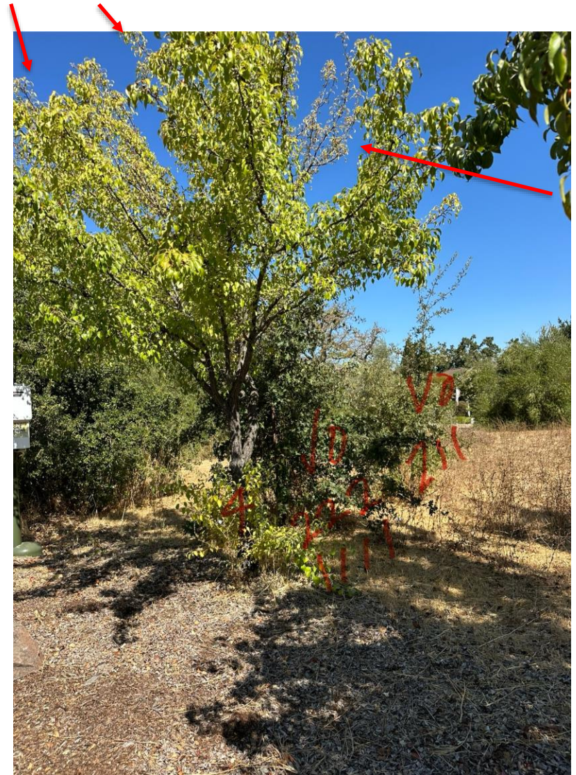
Photo #2. Trees along Jefferson Street. Note branches dying (red arrows)