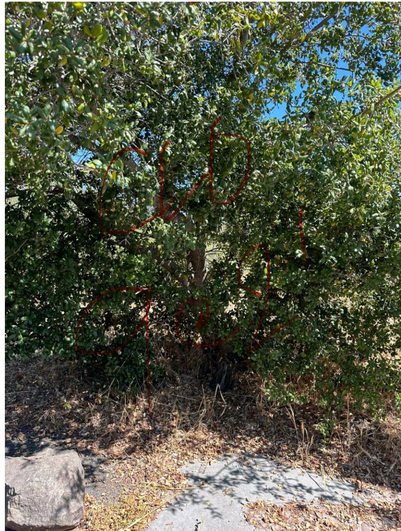
Photo #6. Tree #2, Coast Live Oak. Shrub form with multi-stem structure from 1'.