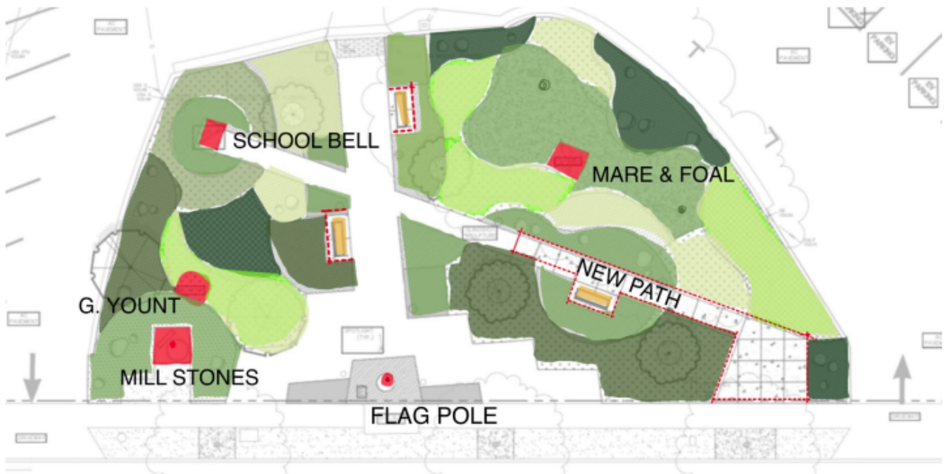
TOWN HALL ENTRY CONCEPT DESIGN